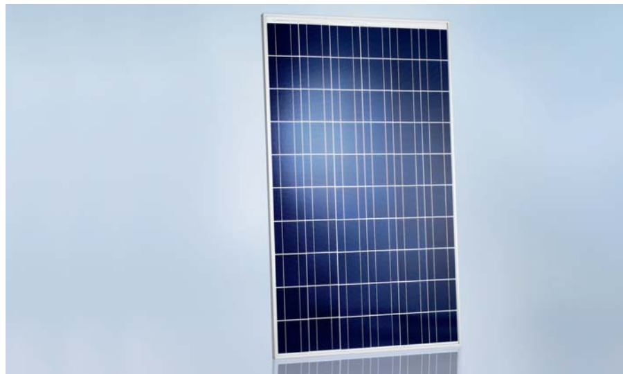
SCHOTT POLY™ 220/225/230/235

SCHOTT Solar has been a leading global developer and manufacturer of solar products for over 52 years. Engineered in Germany and manufactured in America, the high quality SCHOTT Solar PV modules are extremely durable and reliable as demonstrated in several important ways: